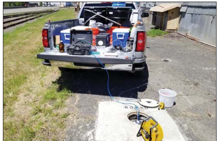
Groundwater Sampling at IR Site 4

On May 8 to May 10, 2018, the Navy performed field work at IR Site 4 and PMA. The Navy inspected, gauged, and collected groundwater samples from 19 groundwater wells at IR Site 4 and measured the groundwater level at one well at the PMA. The groundwater data is being collected for the IR Site 4 Feasibility Study.