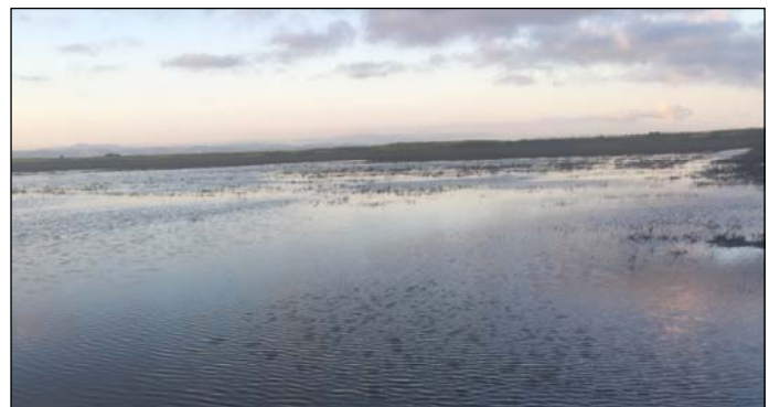
Dredge Pond 3E

On May 30, the Navy mobilized to the UXO 3—Dredge Pond 3E and Northern Marine Corps Firing Range to set up equipment for dewatering Dredge Pond 3E. Between June 4 to June 8, the Navy plans to pump accumulated rain water out of Dredge Pond 3E into an adjacent dredge pond to facilitate drier conditions so field work for the remedial investigation can proceed later this summer.